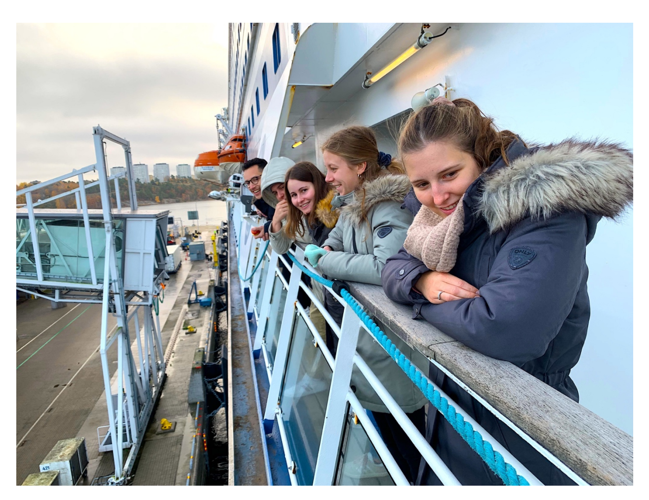
After 5 exciting days en route, the students arrive in Stockholm.

StudyTrip@Sea – we can't wait till 2023.